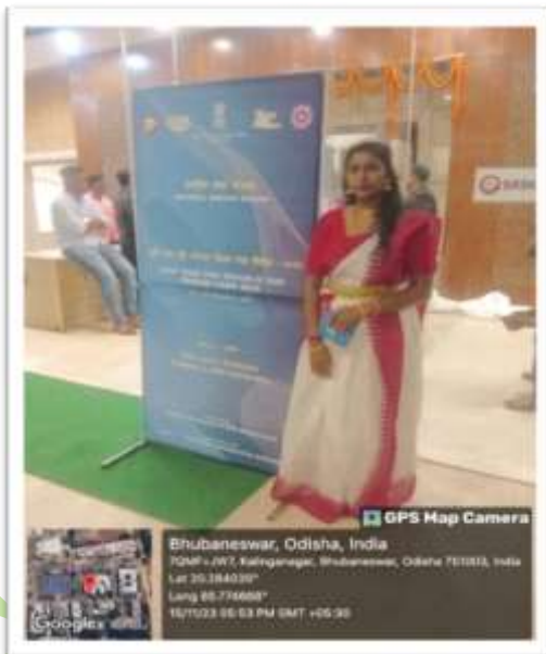
Pre-RD Selection Camp at Bhuvanewar Organized by –NSS Unit Sonamukhi College (Volunteers of NSS)

1 st Rank of State Level NVD Debate Competition, 2023