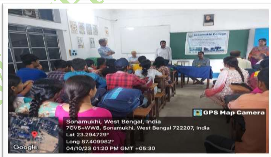
Celebration of World Animal Day at the Department of Zoology, Sonamukhi College on 04 October 2023