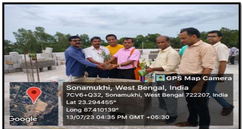
Roof Top Tree Plantation