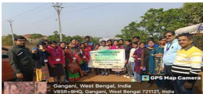
EDUCATIONAL EXCURSION, DEPARTMENT OF POLITICAL SCIENCE, ECONOMICS & SOCIAL WORK (13/12/2023)