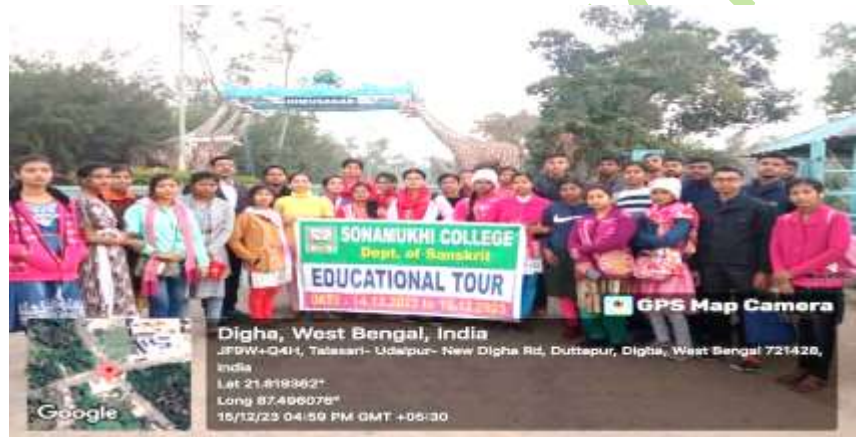
Photo of Educational Tour by Dept. by Sanskrit on 15/12/2023