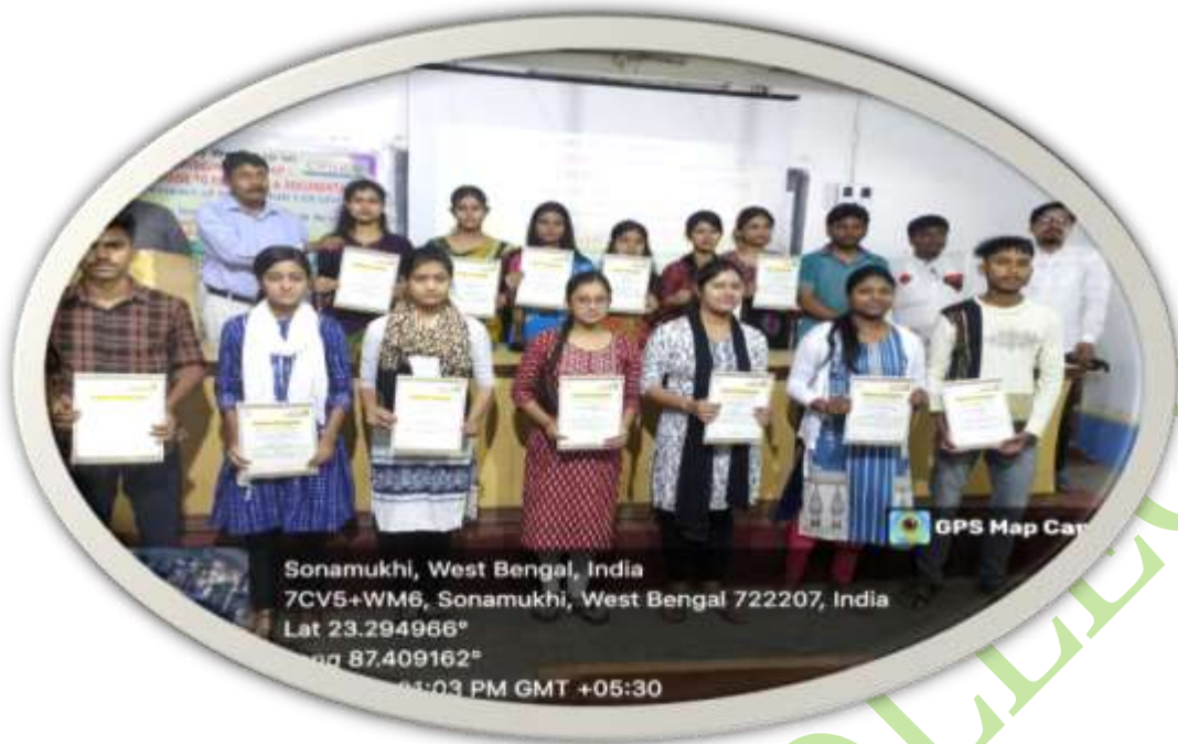
Bridging the Gap: Hands-on Training Documentation & Workshop (April 17th to 19th, 2024)