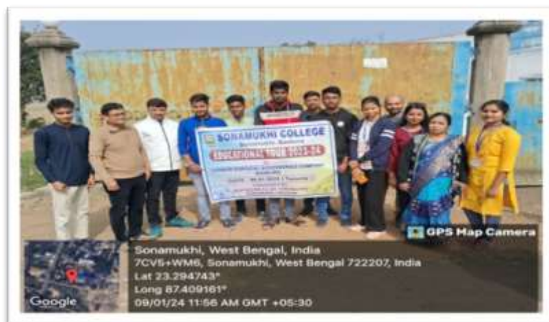
EDUCATIONAL EXCURSION By DEPT. OF CHEMISTRY, 09/1/2024