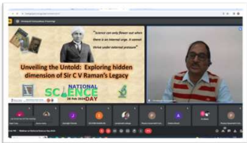
Celebration of National Science-Day at the Department of Physics on 08 January 2024