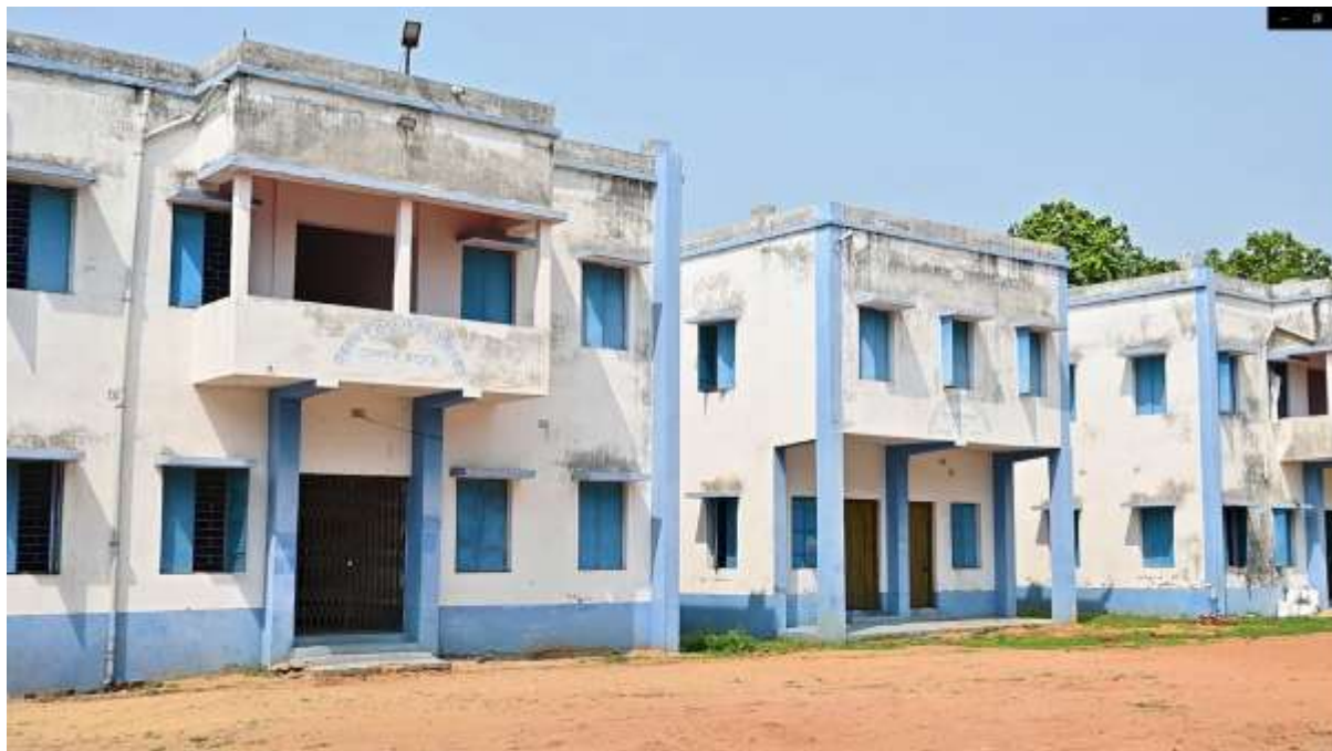
Haranath Kusumkumari Chhatrinibas

Hostel Facility: The college has one hostel for boy students of the college ( Indira Chhatrabas, capacity-20 ) and one hostel for the girl students of the college ( Haranath Kusumkumari Chhatrinibas, capacity-40 ). Both the hostels are equipped with Lodging (2/3/4 sharing) facility, Washroom facility, Filter Water facility, Night Guard facility, Kitchen with Dining facility, etc. Also, Internet connectivity through Wi-Fi and recreation facility (Television and Carom) is available in both the hostels.