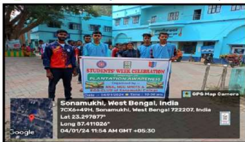
Plantation awareness organized by Eco-Club in association with NSS & NCC of Sonamukhi College

(a) Attendance in class (b) Annual income of the parents (c) AAY card (d) Samajik women Suraksha Card.