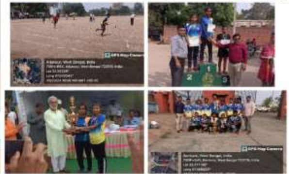
Inter-college Games & Sports 23-24: Female-1st, Male-2nd