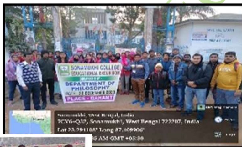
Educational Tour of Philosophy Department to (Prakriti Path) Baranti Lake, Purulia on 20 th December, 2023