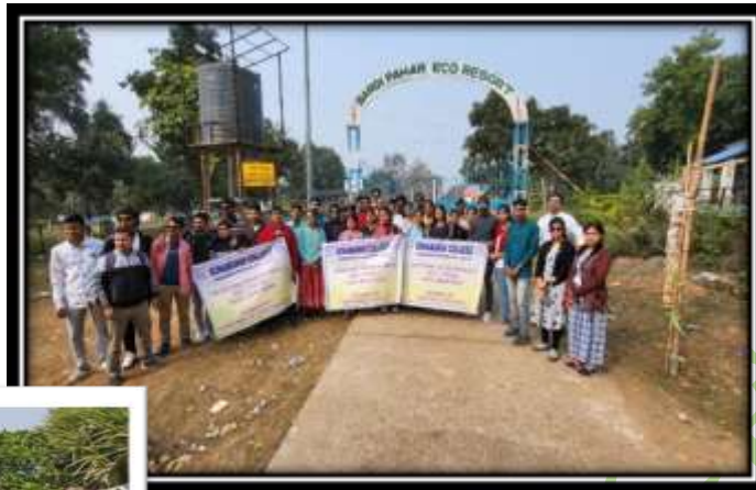
Educational excursion at Bordi Pahar of the Department of Zoology, Sonamukhi College on 11 January, 2024