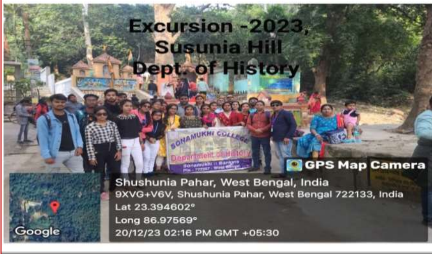
Photo of Educational Tour by Dept. by History on 15/12/2023