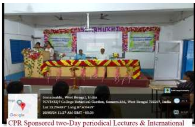
CPR Sponsored two-Day periodical Lectures & International Seminar on "Philosophical Contribution of Contemporary Thinkers", Dept. of Philosophy, Sonamukhi College.