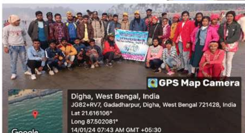
Educational Excursion to Digha by the Department of Physical Education, 14/1/2024