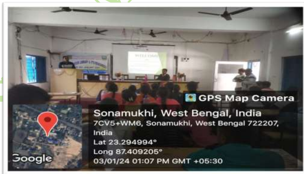
Image from the classes of Add on Course on Basic Information Literacy organized by Central Library in the Academic Session 2023-2024