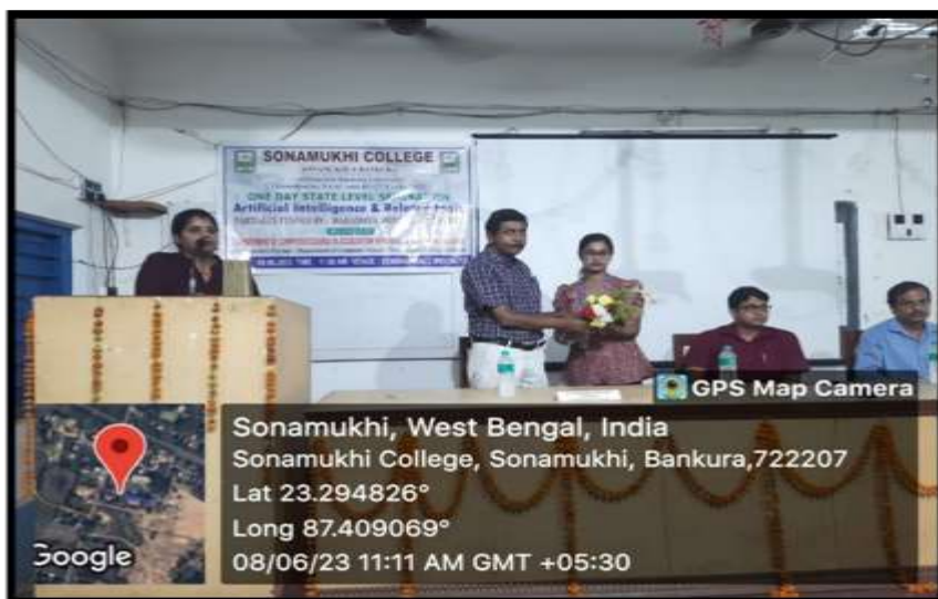
One Day State Level Seminar on Artificial Intelligence and Related Topic organized by Dept. of Computer Science in Association with IQAC, Sonamukhi College, Sonamukhi, Bankura on June, 8 th 2023