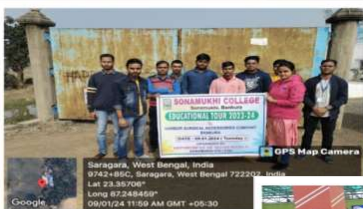
Photo from Geographical Excursion, Dept. of Geography, 2023.